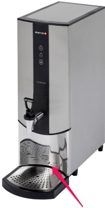
Ecoboiler, single screw to remove front lower panel