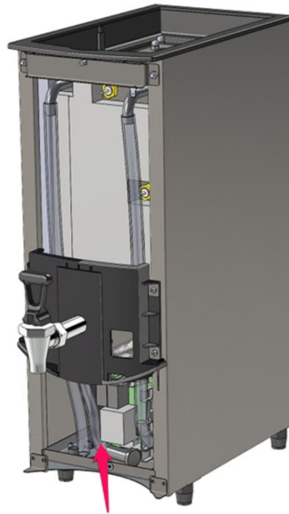
Drain hose is located bottom left in all model variants.